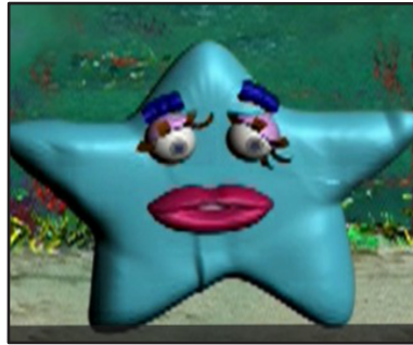
Blanche the Singing Starfish

school in 2002 and earned a 2-year degree in Multimedia from ITT. My animated capstone project featured my alter-ego, "Blanche the Singing Starfish" (Blanche is my middle name). As it happened, tech writing paid the bills, but writing, editing, and graphic design have been satisfying sidelines.